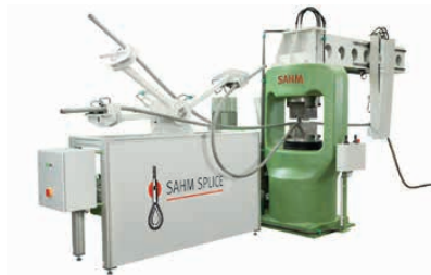
Optional Rigging Arm.

Our 4000t Down Stroke Press sets itself apart thanks to its very good accessibility and the piston located on top. This means that the workpiece remains in position during swaging and is particularly simple to finish.