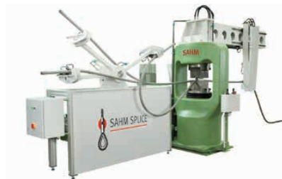
Optional Rigging Arm.